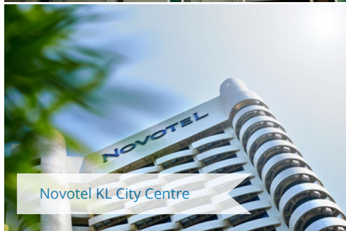
Novotel KL City Centre